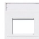
2-Port 50mm x 50mm adapter with label