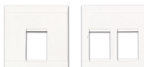
45mm x 45mm adapter, no label