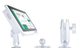
Vehicle-mounted ball head rotatable stands mounting